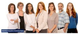
MedStar Integrative Medicine Team

Located on the campus of MedStar Montgomery Medical Center, MedStar Health Center for Integrative Medicine provides patient-centered care...