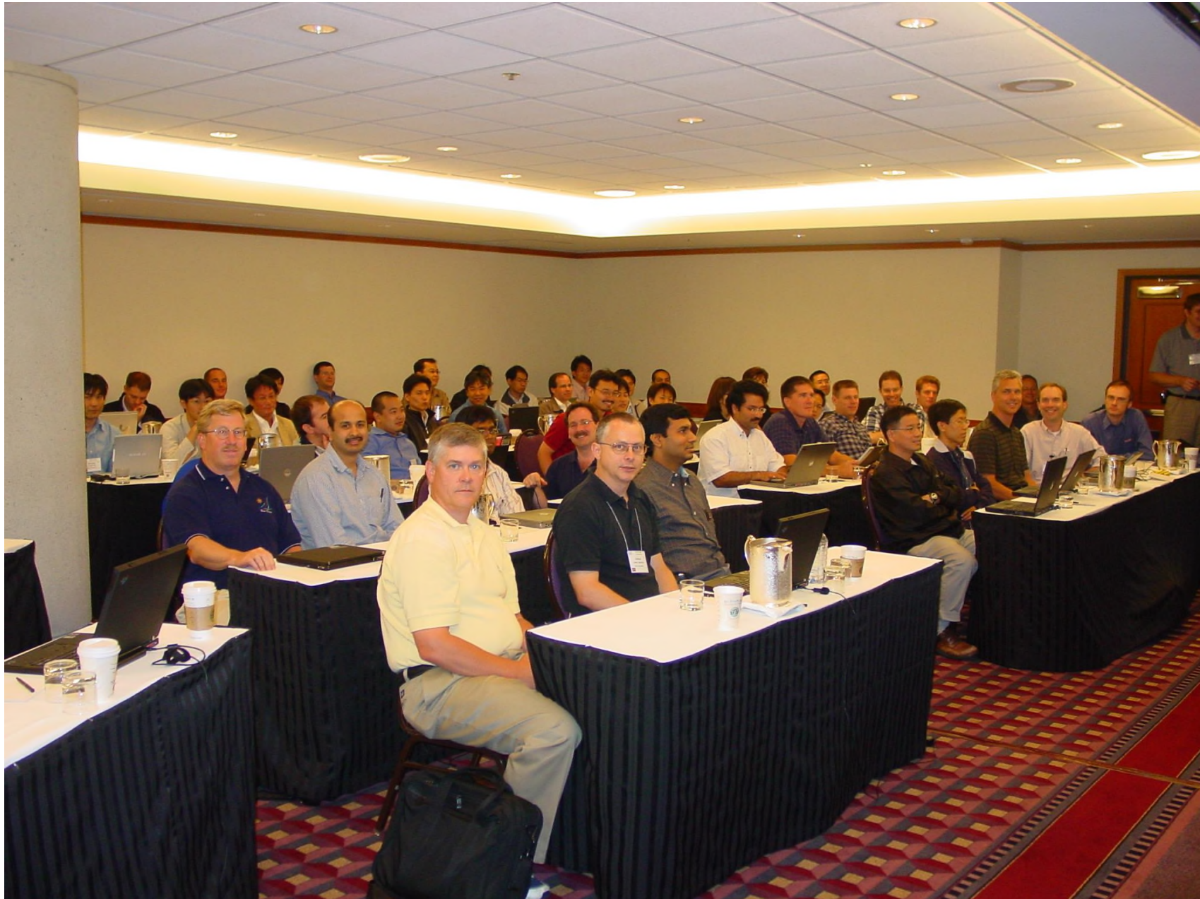
Exhibit 1019 Panasonic v. UNM IPR2024-00364