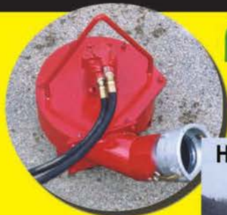
Hydraulic Manure Pit Pumps 800 to 3000 GPM

Send us your Krohne meter for yearly calibration or repair!