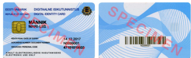
Figure 5: jTOP SLE78-powered digital identity card and e-resident's digital identity card issued from 2014-12-01 [9]

At the end of 2014, the production of identity cards , residence permit cards and digital identity cards switched to jTOP SLE78 platform. The visual design of identity cards and residence permit cards stayed the same (Figure 3 and 4), however, the visual appearance of digital identity cards became a bit more colorful (see Figure 5). The EstEID functionality was implemented in a JavaCard applet on top of Infineon's product SLJ52GCA080CL [12] masked on the SLE78CLX800P chip [13] that runs the jTOP JavaCard operating system developed by Trusted Logic. With the switch to jTOP SLE78 platform, the e-resident's digital identity card was introduced (Figure 5). This card is issued through the e-Residency program [14] to persons who are not residents of Estonia. In the beginning of 2017, the diplomatic identity card was introduced (Figure 6). This card is issued to persons with diplomatic status. Initially, the jTOP SLE78 platform used 2048-bit RSA keys, but due to the ROCA flaw (see Section 3), at the end of 2017, the switch to ECC keys using curve P-384 was made. The jTOP SLE78-powered ID cards were issued until the end of 2018. ID cards manufactured currently are powered by the chip platform supplied by IDEMIA (not covered in this work).