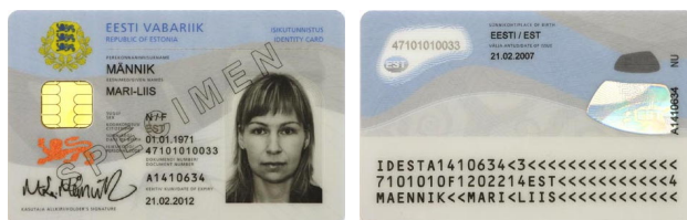
Figure 1: MICARDO-powered identity card issued from 2002-01-01 to 2010-12-31 [9]

In 2002, Estonia introduced the identity card , a mandatory identity document for all Estonian residents aged 15 and above. The electronic functionality of the card was implemented on top of smart card operating system MICARDO Public 2.1 [6]. The smart card interface is documented in the EstEID specification [7], which later became a national standard [8]. MICARDO-powered ID cards were issued from 2002 to 2011 (Figure 1). The platform is limited to 1024-bit RSA keys.