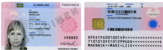
Figure 4: jTOP SLE66/SLE78-powered residence permit card issued from 2011-01-01 [9]