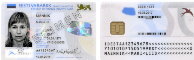
Figure 3: jTOP SLE66/SLE78-powered identity card issued from 2011-01-01 [9]

In 2011, the manufacturing of identity cards switched to a new chip platform implemented on top of Infineon's product JCLX80jTOP20ID masked on a SLE66CX800PE chip [11] (Figure 3). The card runs jTOP (Java Trusted Open Platform) JavaCard operating system developed by Trusted Logic. The EstEID functionality is implemented in the JavaCard applet. The platform uses 2048-bit RSA keys. With the introduction of the jTOP SLE66 platform, the residence permit card was introduced (Figure 4). This card is issued to non-EU third-country nationals residing in Estonia. The jTOP SLE66-powered ID cards were issued until the end of 2014.