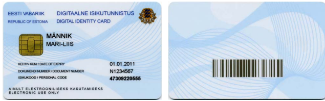
Figure 2: MULTOS-powered digital identity card issued from 2010-10-01 to 2014-11-30 [9]

used. The card is powered by MULTOS I4E platform by Key-Corp [10]. The MULTOS applet has been developed to mimic the MICARDO interface described in the EstEID specification. MULTOS-powered cards were issued until December 2014 (Figure 2). The platform is limited to 1024-bit RSA keys.