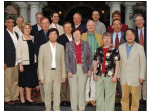
Board of Trustees, May 2007