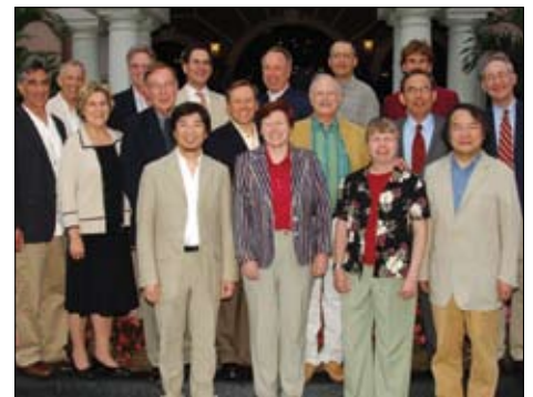
Board of Trustees, May 2007