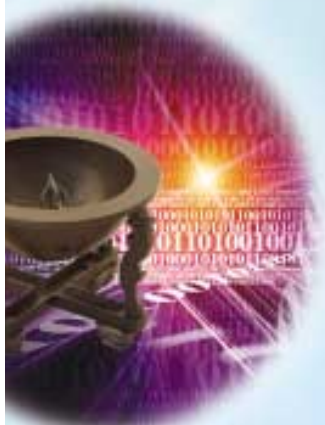
Haesikye A traditional Korean sun dial.