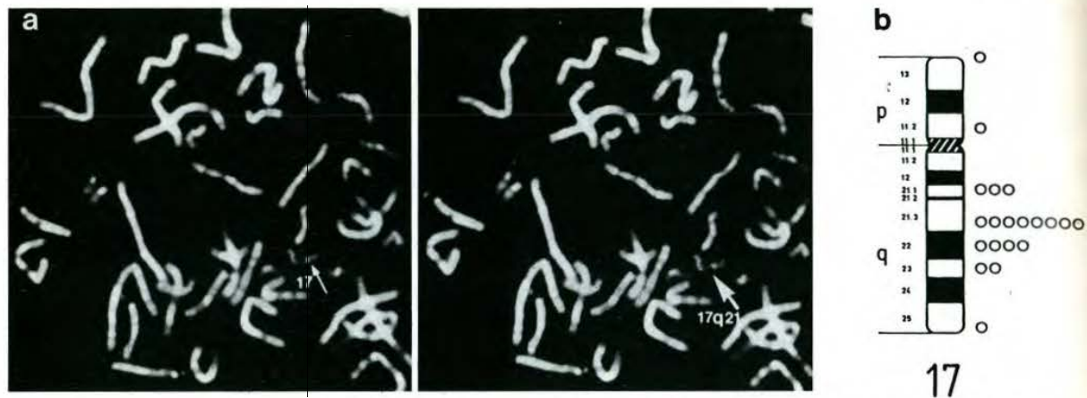
FIG. 1. Localization of the c-erbB-2 gene by in situ hybridization. (a) Photograph of a lymphocyte metaphase spread hybridized with the c-erbB-2 probe nick translated with [ 3 H]dCTP (30 Ci/mmol) and [ 3 H]dTTP (48 Ci/mmol). The specific activity of the probe was 3 \times 10^7 cpm/ \mu g of DNA. The chromosomal DNA was denatured on slides in 70% formamide-2 \times SSC (1 \times SSC is 0.15 M NaCl plus 0.015 M sodium citrate) at 70°C for 2 min and then hybridized in a solution of 50% formamide-2 \times SSC-40 mM sodium phosphate (pH 7.0)-10% dextran sulfate-denatured salmon sperm DNA (100 \mu g/ml)-1 \times Denhardt solution for 16 h at 40°C. After hybridization, the slides were rinsed for 10 min twice in 50% formamide-2 \times SSC at 40°C and then several times in 0.2 \times SSC at 37°C. Autoradiography was performed using half-strength Sakura NR-M2 emulsion (Konishiroku, Tokyo) for 3 weeks at 4°C. Chromosomes were Q banded using the double-staining method with quinacrine-mustard and Hoechst 33258 (27) and analyzed under a fluorescence microscope (left). Silver grains were detected by visible light and were identified on Q-banded chromosomes (right). (b) Distribution of 20 grains over chromosome 17.

with t(15;17), translocation of the p53 gene to chromosome 15 was observed in three of three APL cases tested (8) by in situ hybridization. Thus, further analysis of APL cells with t(15;17), which include in situ hybridization on chromosome