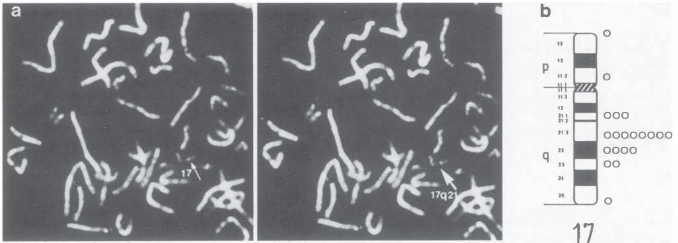
FIG. 1. Localization of the c-erbB-2 gene by in situ hybridization. (a) Photograph of a lymphocyte metaphase spread hybridized with the c-erbB-2 probe nick translated with [ 3 H]dCTP (30 Ci/mmol) and [ 3 H]dTTP (48 Ci/mmol). The specific activity of the probe was 3 \times 10^7 cpm/ \mu g of DNA. The chromosomal DNA was denatured on slides in 70% formamide- 2\times SSC ( 1\times SSC is 0.15 M NaCl plus 0.015 M sodium citrate) at 70°C for 2 min and then hybridized in a solution of 50% formamide- 2\times SSC-40 mM sodium phosphate (pH 7.0)-10% dextran sulfate-denatured salmon sperm DNA (100 \mu g/ml)- 1\times Denhardt solution for 16 h at 40°C. After hybridization, the slides were rinsed for 10 min twice in 50% formamide- 2\times SSC at 40°C and then several times in 0.2\times SSC at 37°C. Autoradiography was performed using half-strength Sakura NR-M2 emulsion (Konishiroku, Tokyo) for 3 weeks at 4°C. Chromosomes were Q banded using the double-staining method with quinacrine-mustard and Hoechst 33258 (27) and analyzed under a fluorescence microscope (left). Silver grains were detected by visible light and were identified on Q-banded chromosomes (right). (b) Distribution of 20 grains over chromosome 17.

with t(15;17), translocation of the p53 gene to chromosome 15 was observed in three of three APL cases tested (8) by in situ hybridization. Thus, further analysis of APL cells with t(15;17), which include in situ hybridization on chromosome