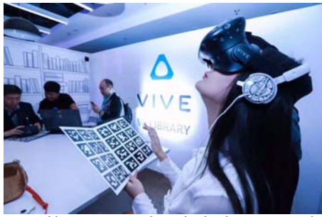
( http://technode.com/2016/10/29/htc-vive-b2b/ )