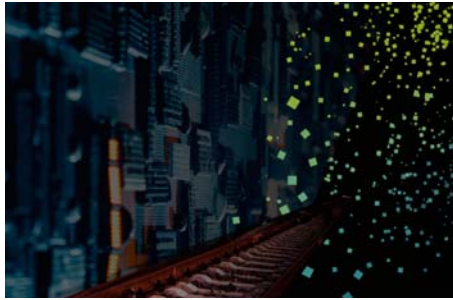
( http://technode.com/2016/10/28/tcbj-speaker-line-successful-crossovers/ )