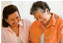
Living With Afib? 10 Treatments WebMD