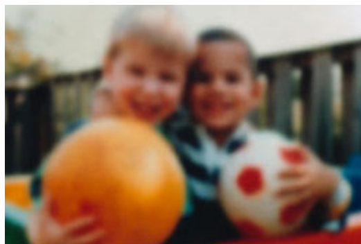
The same scene as viewed by a person with cataract