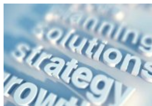
Business Strategy meets the Lean Startup: Staying... September 4, 2015