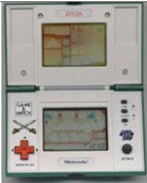
Nintendo's Game & Watch Series, 1980-1991

(Source: Ex. 2025, Engadget: A Brief History of Handheld Video Games)