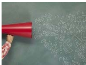
The people have spoken and the rankings are in:... March 18, 2015