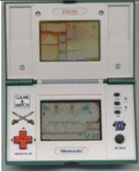
Nintendo's Game & Watch Series, 1980-1991

(Source: Ex. 2025, Engadget: A Brief History of Handheld Video Games)