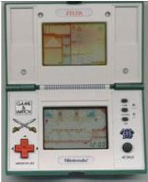
Nintendo's Game & Watch Series, 1980-1991

(Source: Ex. 2025, Engadget: A Brief History of Handheld Video Games)