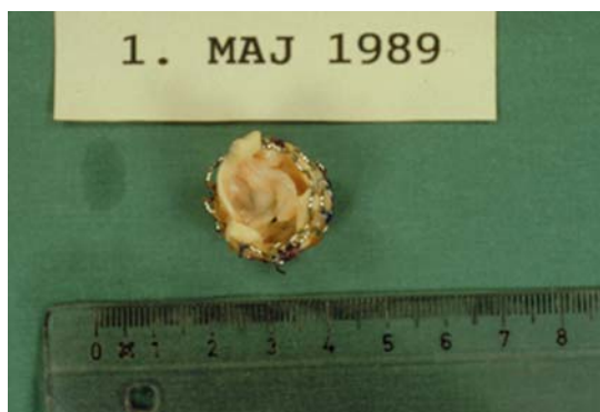
Figure 2. The first Andersen stent valve implanted on May 1, 1989. Abbildung 2. Die erste Andersen-Stentklappe, implantiert am 01.05.1989.