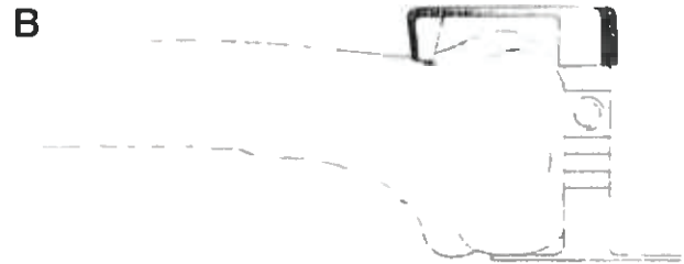
Exhibit 2002 Smith & Nephew v. Bonutti Skeletal Innovations LLC Trial: IPR2013-00629