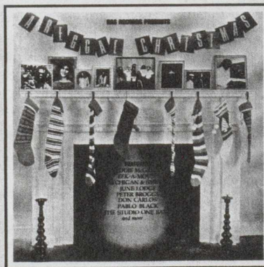
Move over Bing Crosby. It's time to get rockin' to the RAS Records Reggae Christmas LP. Featuring Jamaica's top recording artists, this is a delightful holiday treat everybody can rejoice to. Retailers make sure you have plenty in stock. Contact RAS Records, 301 564-1295. Also City Hall, Rounder, Acton, Kenyon, Gemini, Big State, Richmond Bros., Western Merch. and Silo distribution.